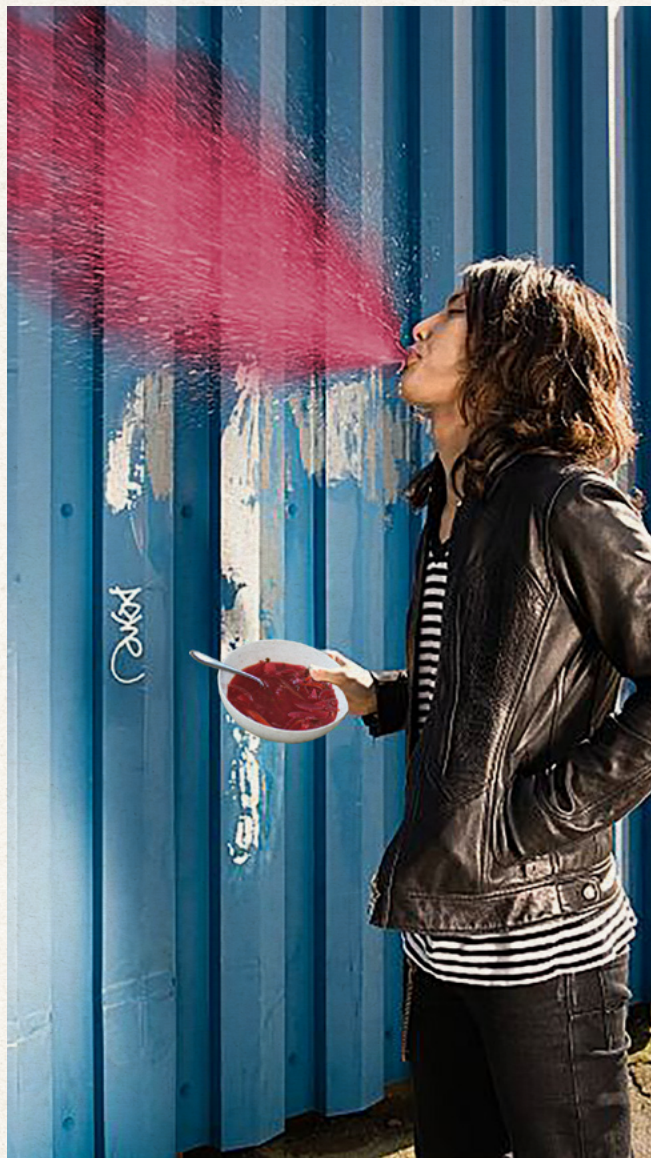
Spitting out ALL my borscht to stick it to Putin

If that’s the case, let me make something clear right now: I am a celebrity just like any of the other guys. No matter what my politics may be, being a celebrity comes first. And if there’s one thing that’s true at this moment, any celebrity will sell their soul to be the face of a crypto ad in 2022. I simply ask that you give me proper consideration as well. 🙏